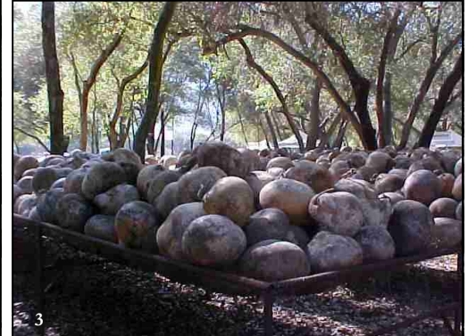
Fig. 1 Field of gourd plants in fruit, Welburn Gourd Farm, 2007. Fig. 2 Detail of gourd plants in fruit. Fig. 3 Dried gourds on racks.

I have ordered gourds via the Internet and am always delighted to receive my box filled with the marvels of the plant world. However, there is nothing like going to a gourd farm and selecting your own gourds.